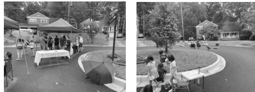
Great time had by all at the Magruder Lane block party

This year, several neighbors on different blocks have organized parties.